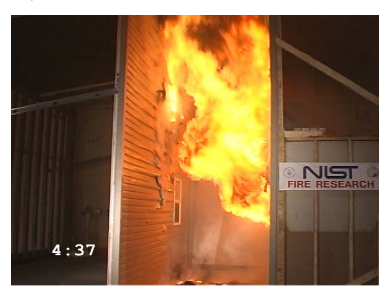
In a NIST lab test, flames from a simulated house with combustible exterior walls ignite a similar "house" six feet away. The numbers in the corner are the time (in minutes) since the start of the test.